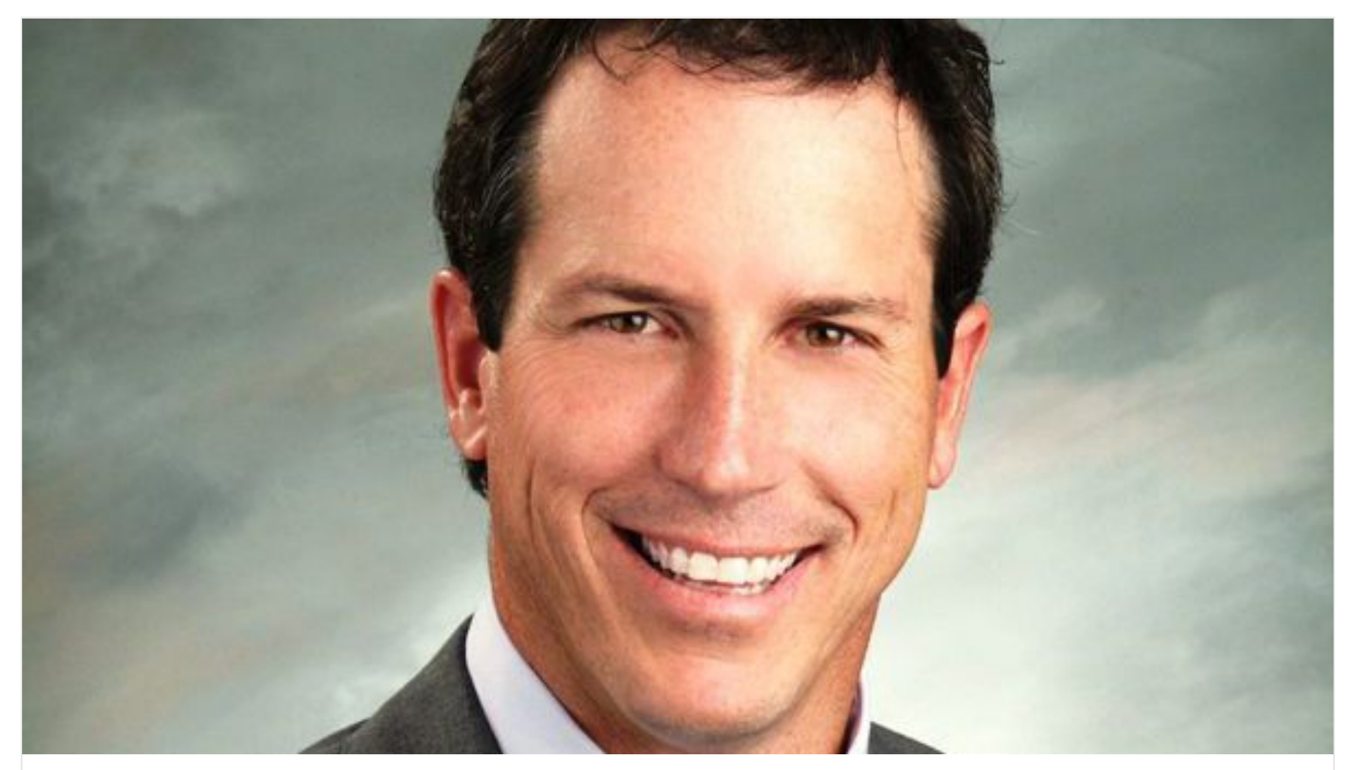
Biz tip of the week: How to make powerful presentations